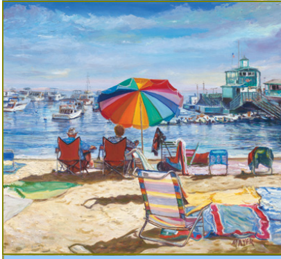
After Sun Aloe Shea Butter & Olive Oil Soap

Fresh Aloe - Our handcrafted After Sun Aloe Soap is a super moisturizing body bar that is made with the finest all natural ingredients of pure saponified Shea Butter, Olive Coconut and Palm oil. Blended with the highest quality fragrance of Fresh Aloe, herbs and color. A refreshing favorite that soothes your skin. Made by America's Finest Cold Processed Soap Manufacturer Ipswich Bay Soap Company